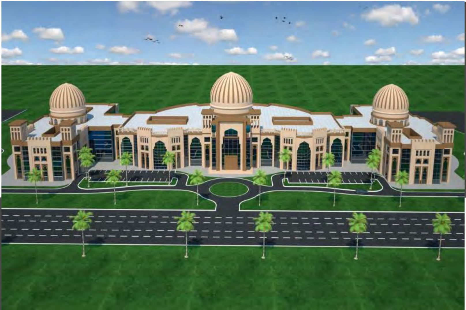
SEWA OFFICE BUILDING ( G + 2 )