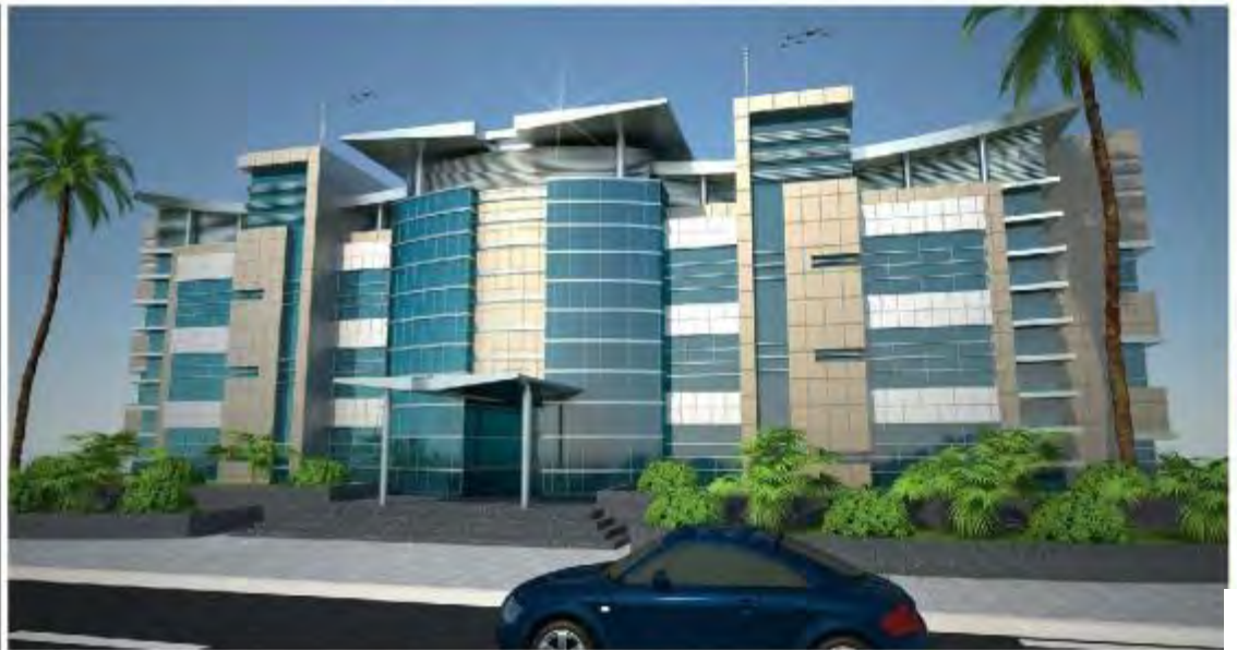
HOSTEL IN SHARJAH G+3