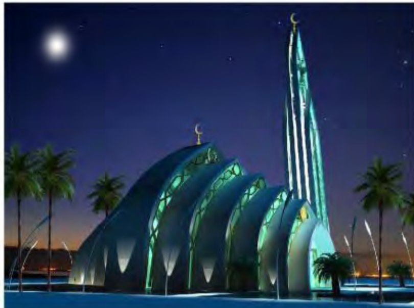
MOSQUE 700 PERSONS, SHARJAH