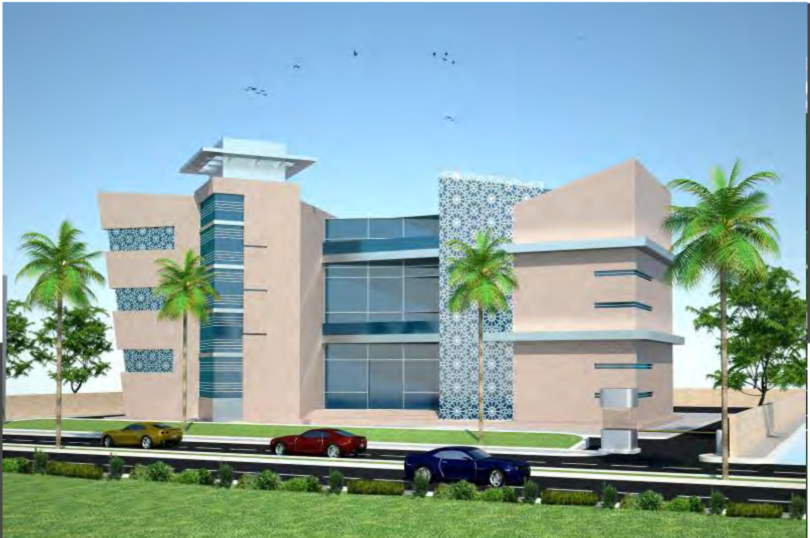
FEWA OFFICE BUILDING ( G + 2 )