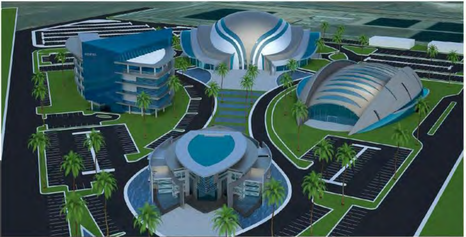
Fujairah sport complex