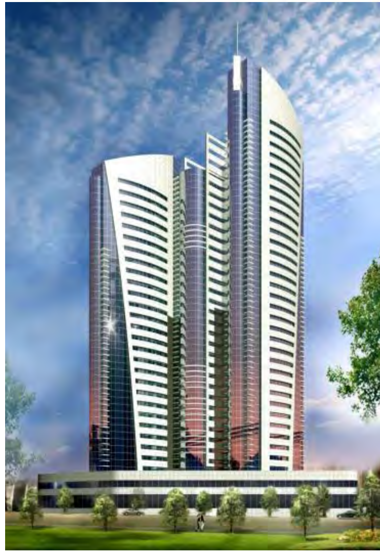
Galfa Tower, Ajman (G + 2P + 35)