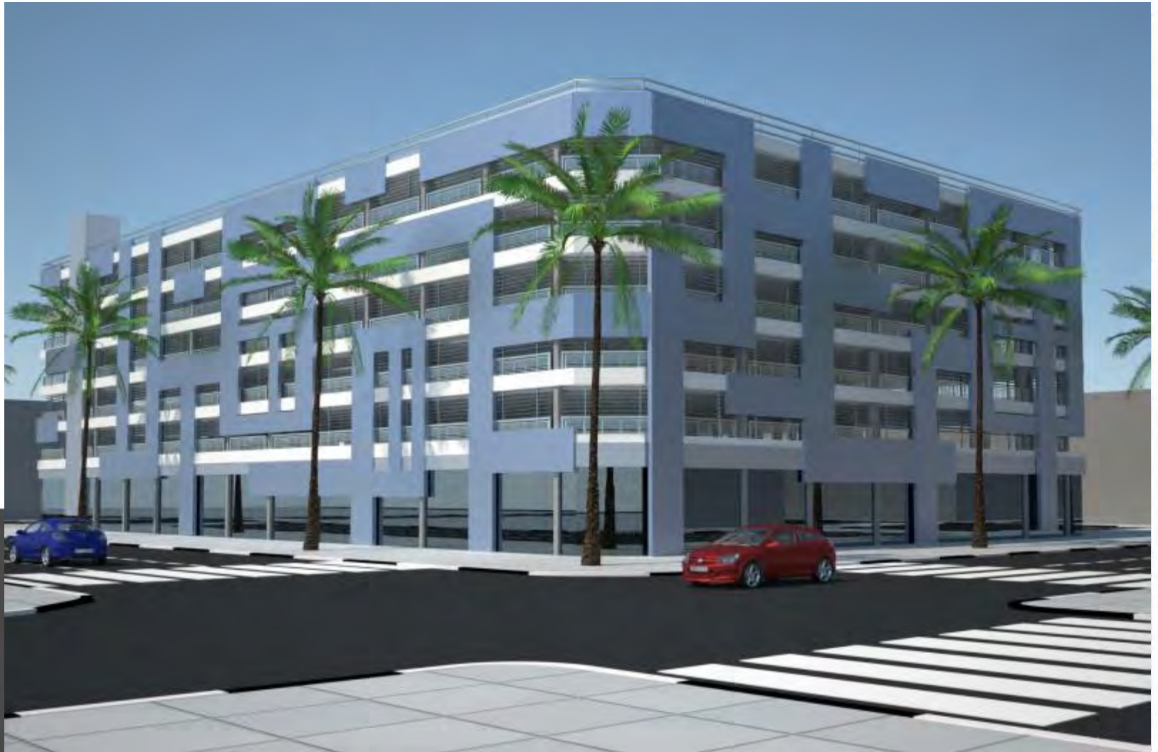
MULTISTORY CAR PARKING ( G + 5 ) SHARJAH