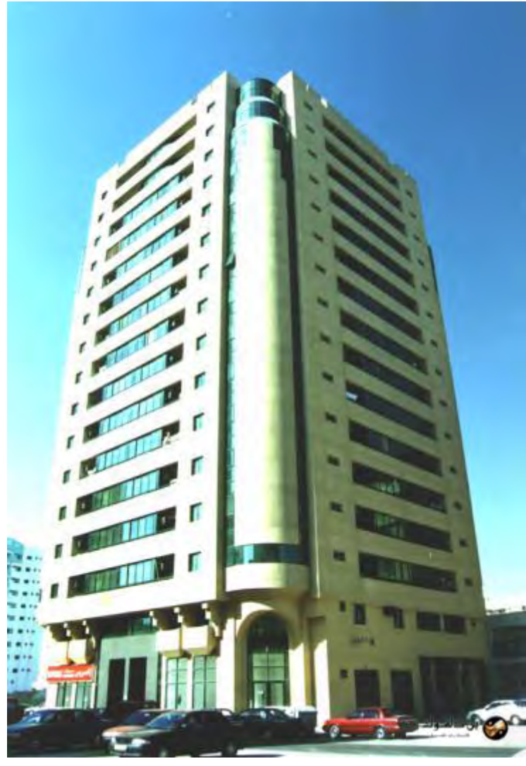
Al Zarouny Building, Ajman (G + M + 14 )