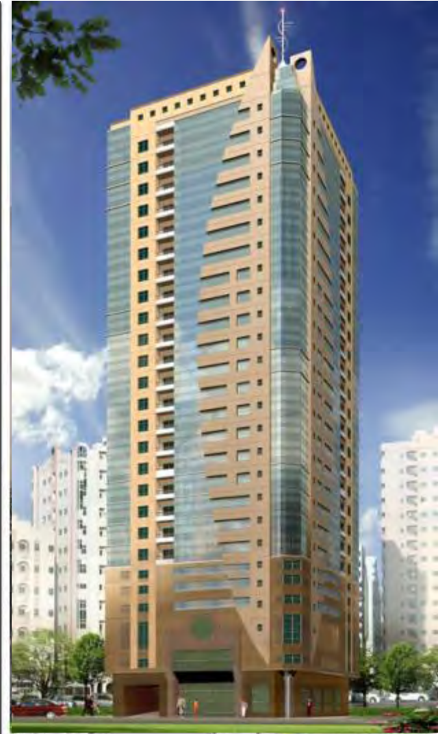
Al Hajri Tower, Sharjah ( G + 5P + 27 )