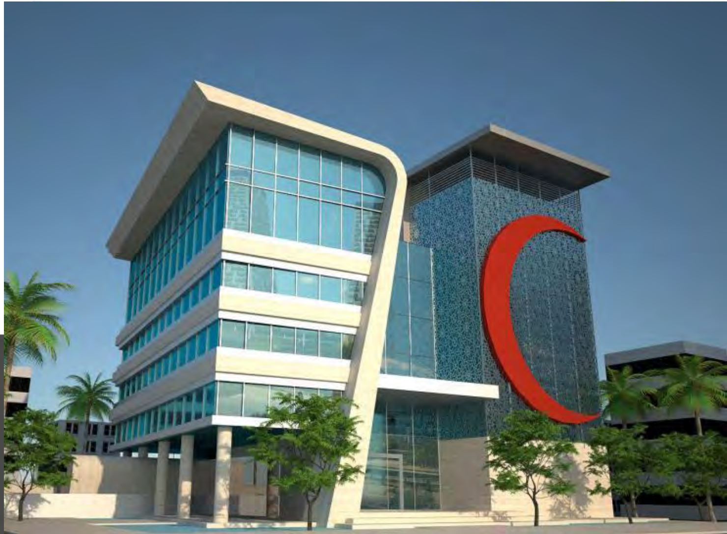
RED CRESCENT BUILDING ( G + 5 )