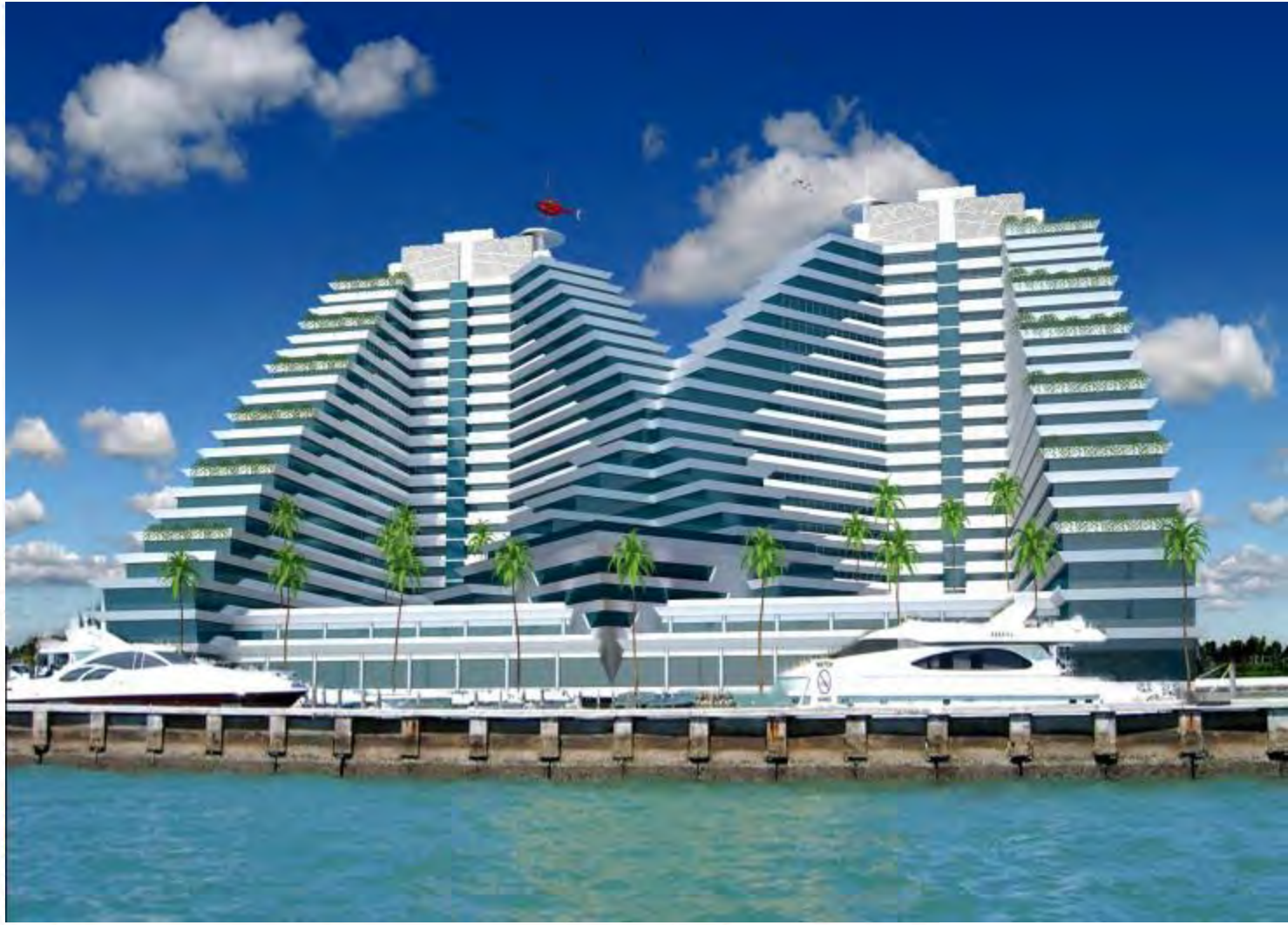
5 Stars Hotel, Sharjah ( G + 3+ 15 )