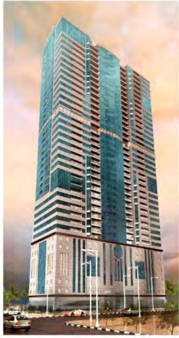
ZAKHER TOWER, SHARJAH ( G + 8 + 40 )