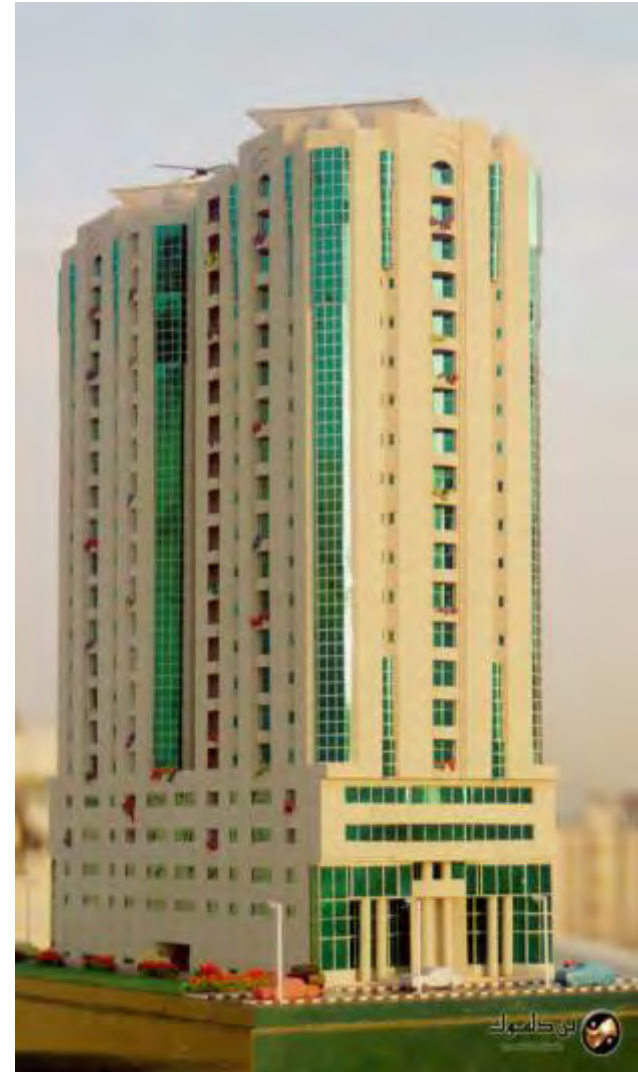
Al Sayyah Twins Towers, Sharjah (G + 4P + 20 )