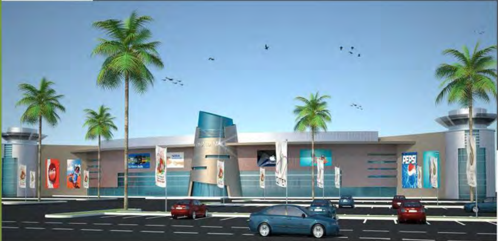
AL-Dhaid Shopping Center, Sharjah