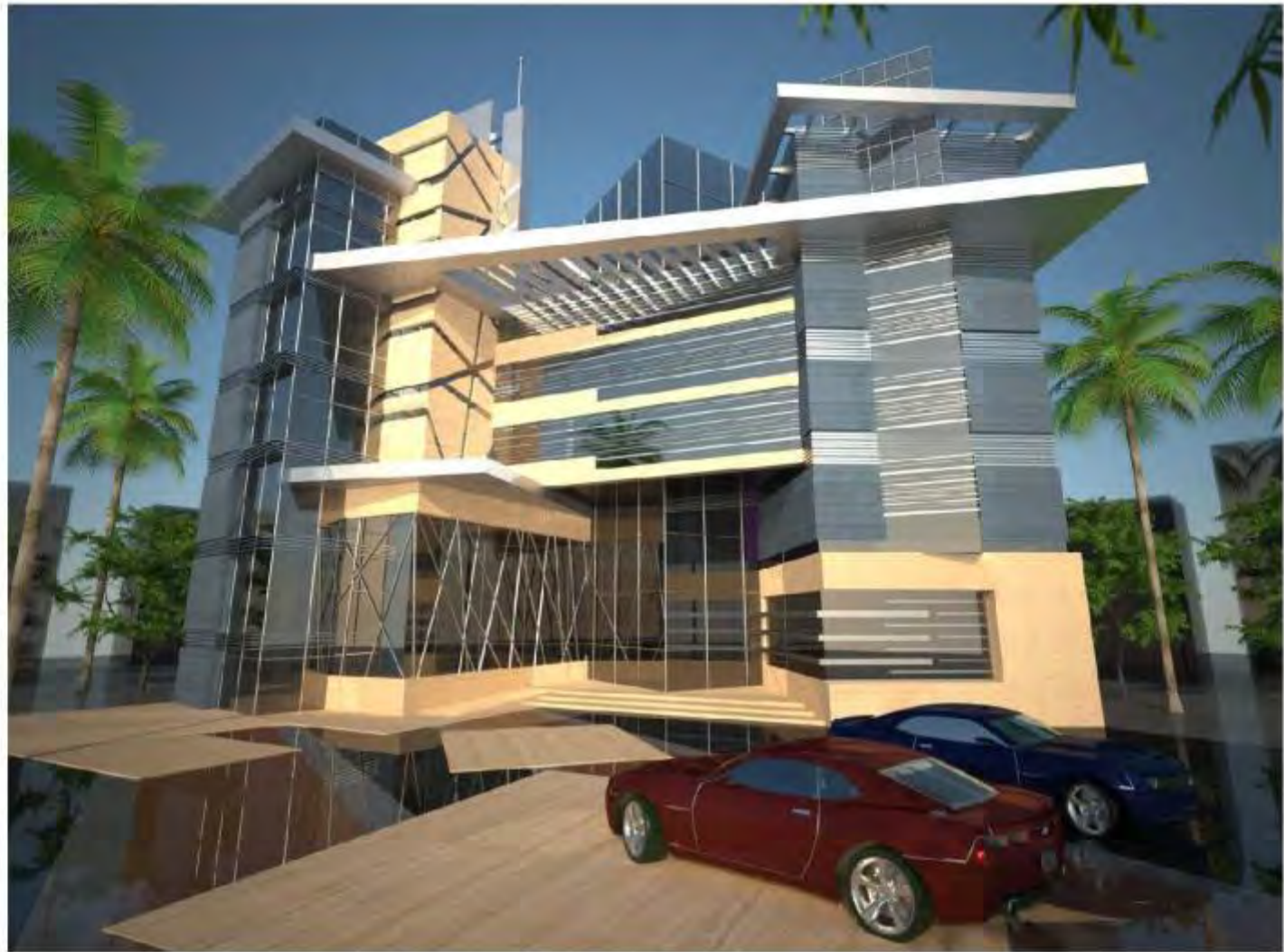
FEWA OFFICE BUILDING ( G + 4 )