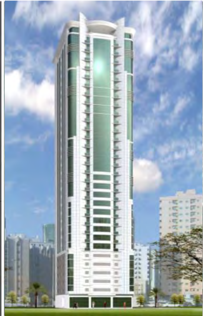
AL-MINHALI TOWER, SHARJAH ( G + 5P + 25 )