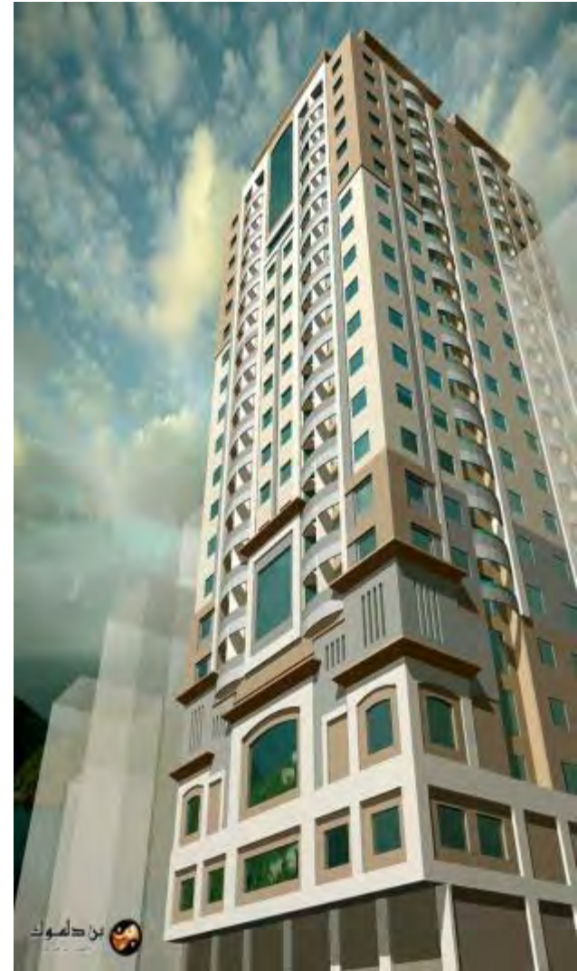
AL Qubaisy Tower, Sharjah ( G + 5P + 20 )