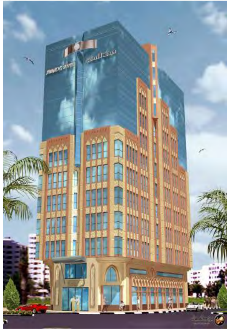
Al-Shamsi 4 Stars Hotel, Sharjah ( G + M + 11 )