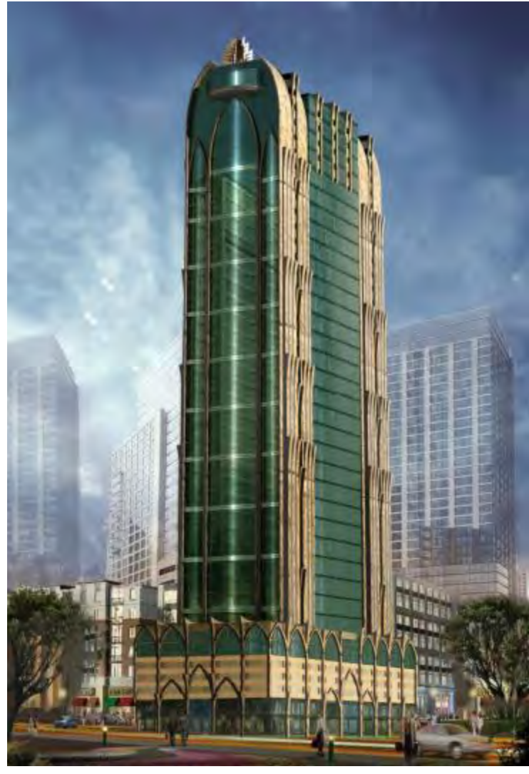
Residential Tower, Sharjah ( 3B + G + 4P + 34 )