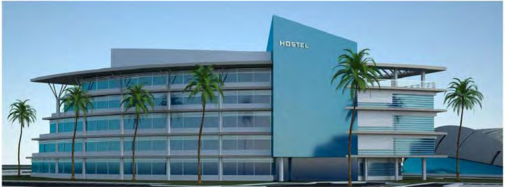
HOSTEL IN FUJAIRAH G+4