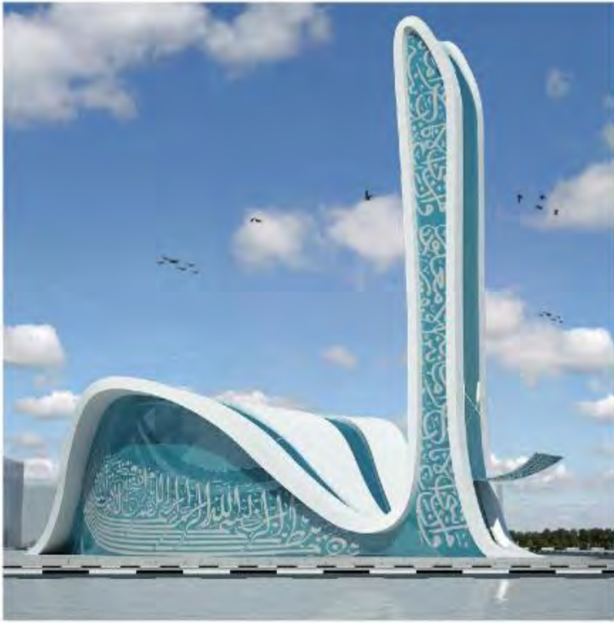
SOROUH MOSQUE 400 PERSONS, ABU DHABI