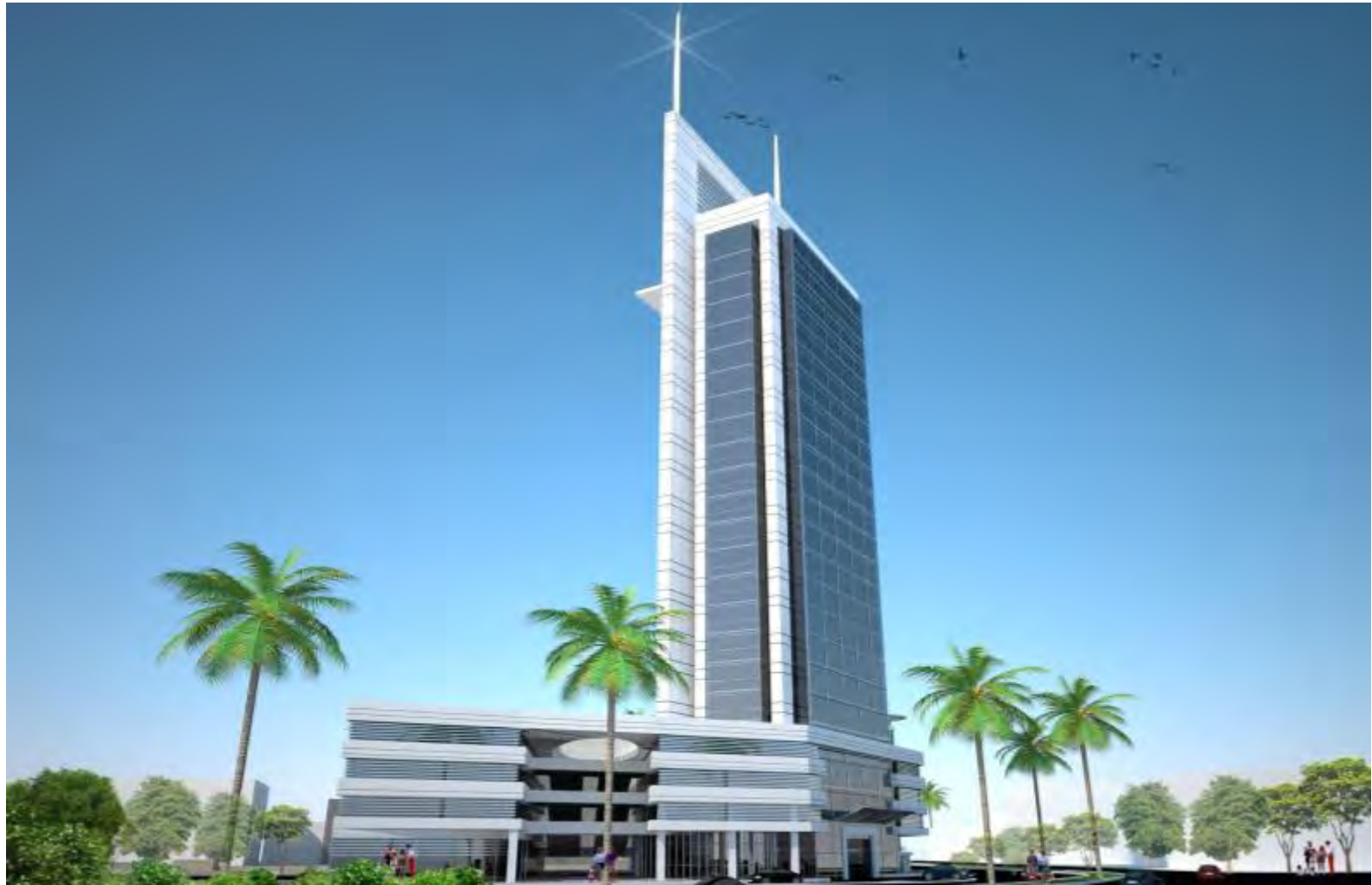
Residential Tower, Abu Dhabi ( G + 4P + 20 )