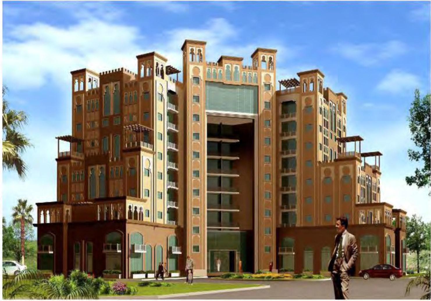
Silicon 5 Stars Hotel, Dubai ( B + G + 10 )