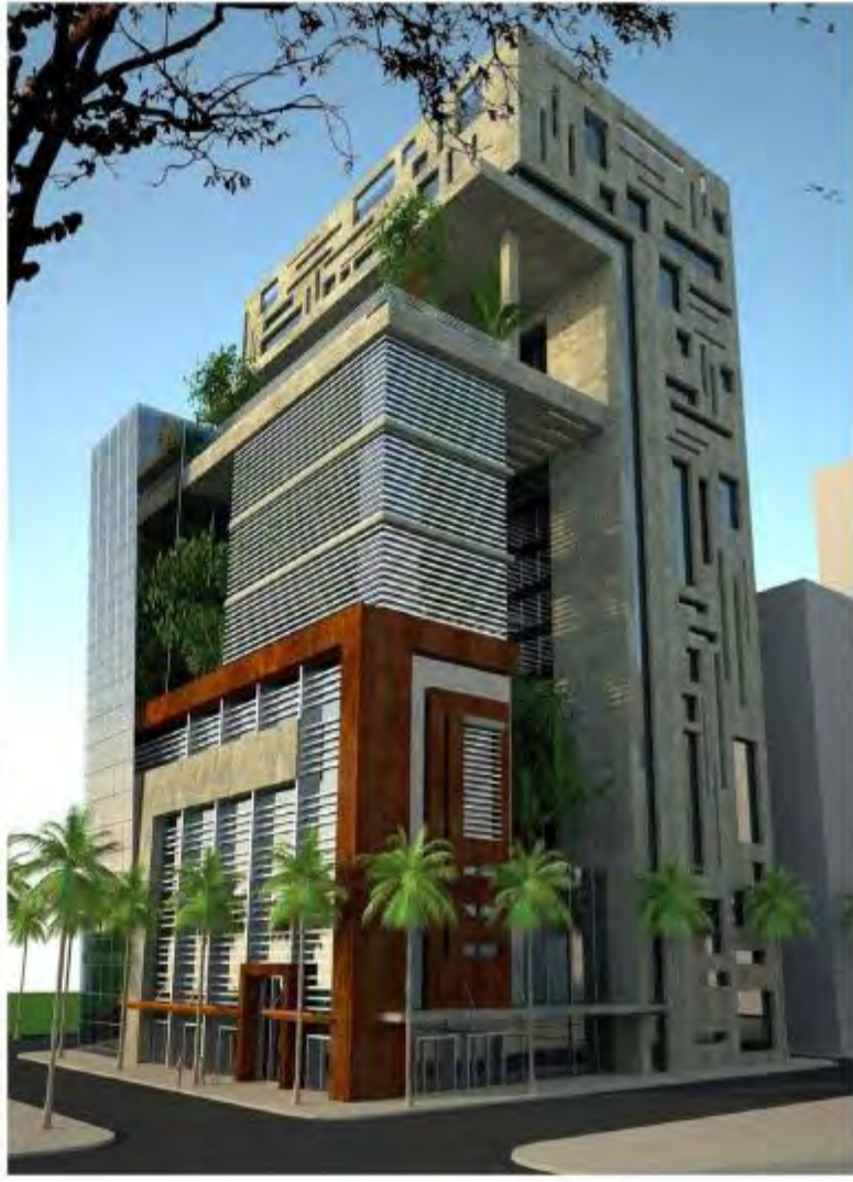
Jabal Ali Waterfront BUILDING, Dubai ( 2B + G + M + 18 )