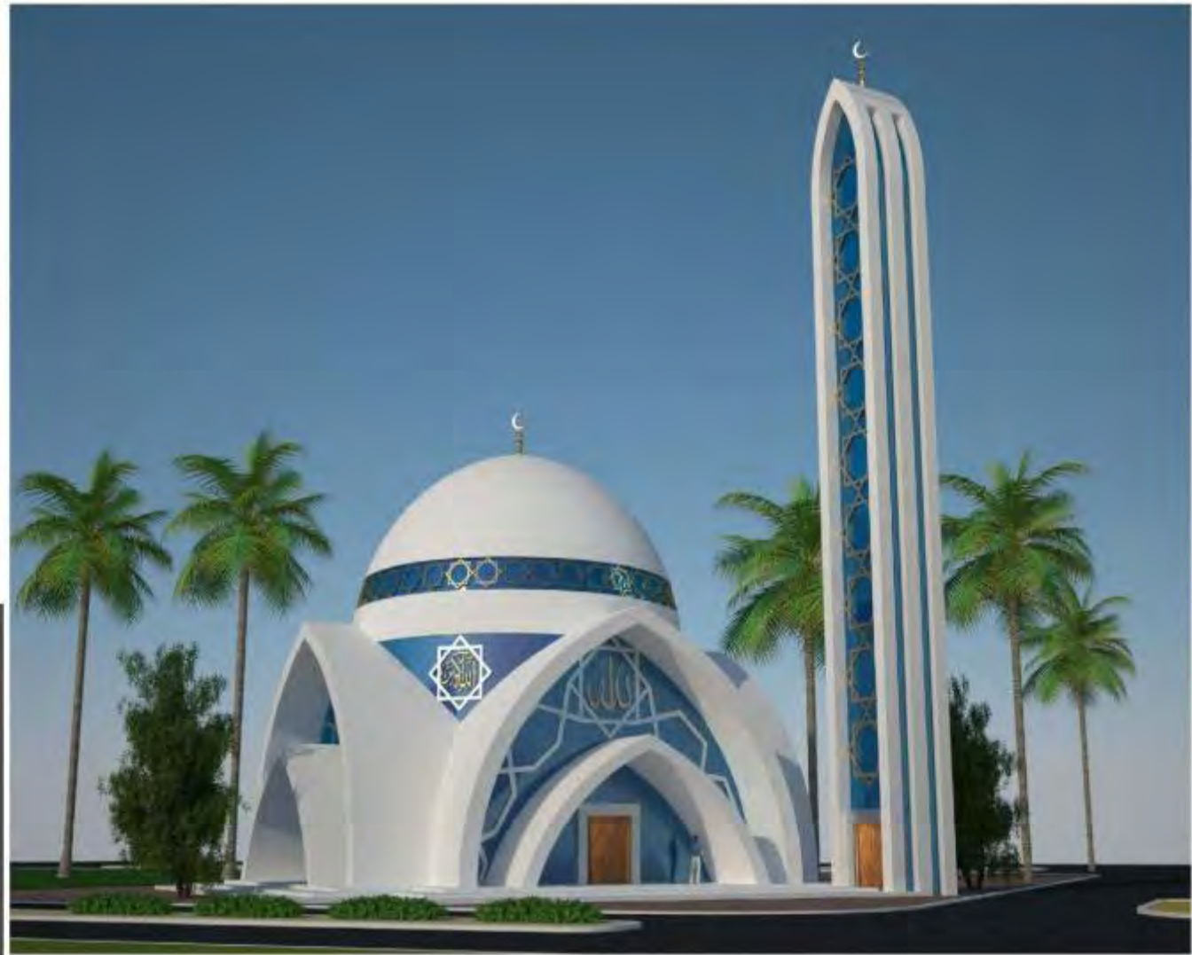
MOSQUE 250 PESRONS, SHARJAH