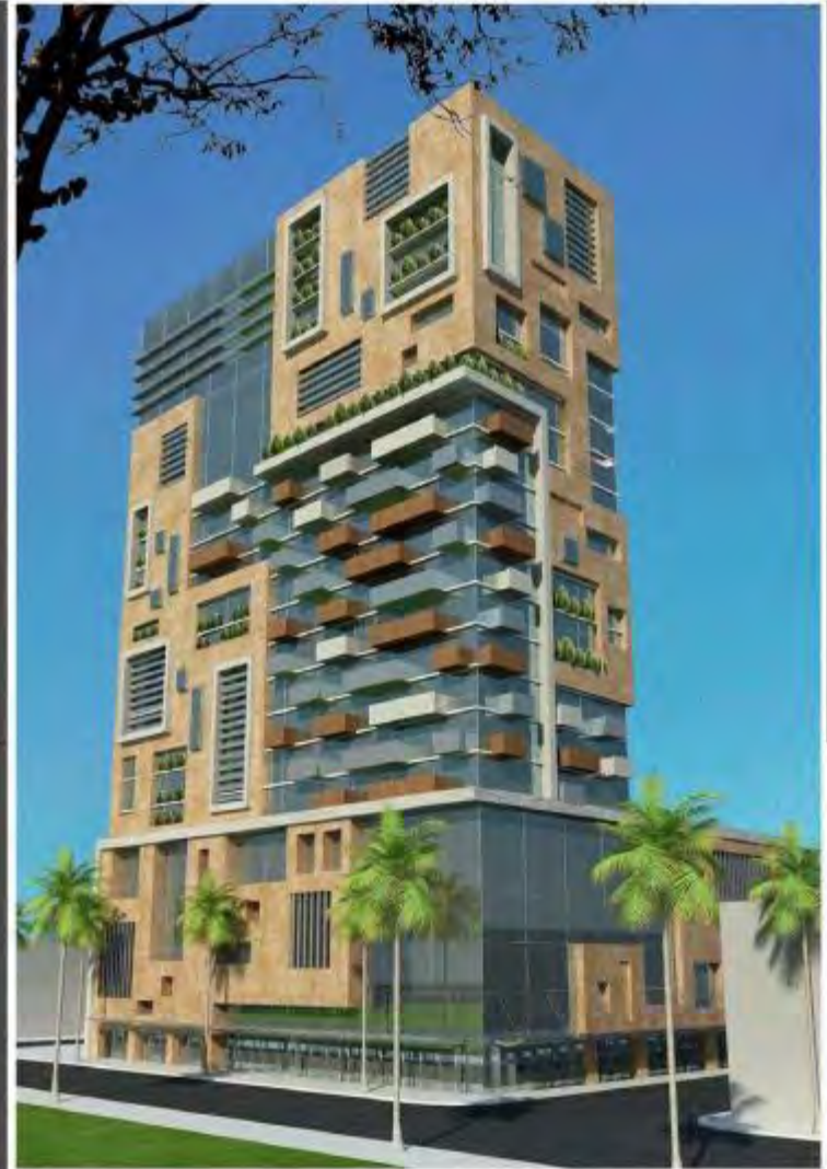
Jumairah Village Circle, Dubai ( 2B + G + 5P + 18 )