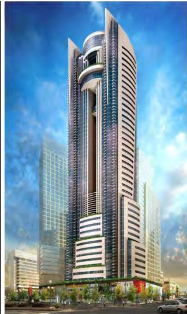
AL Jaber Building, Ajman (G + 3P + 43)