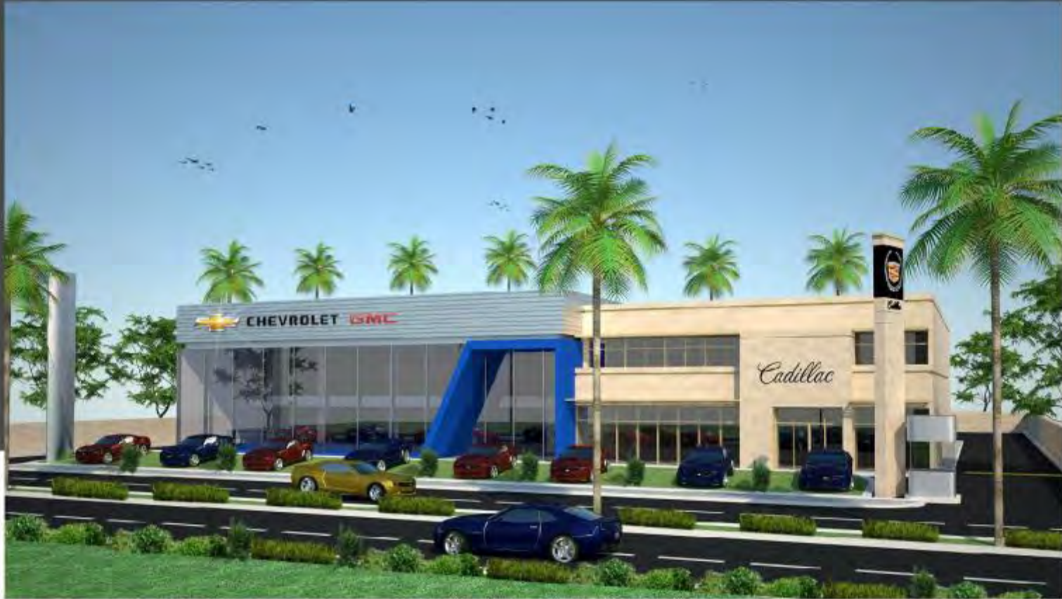
Proposed dealership facility, showroom and workshop at Jeddah, KSA. Owner: General Motors