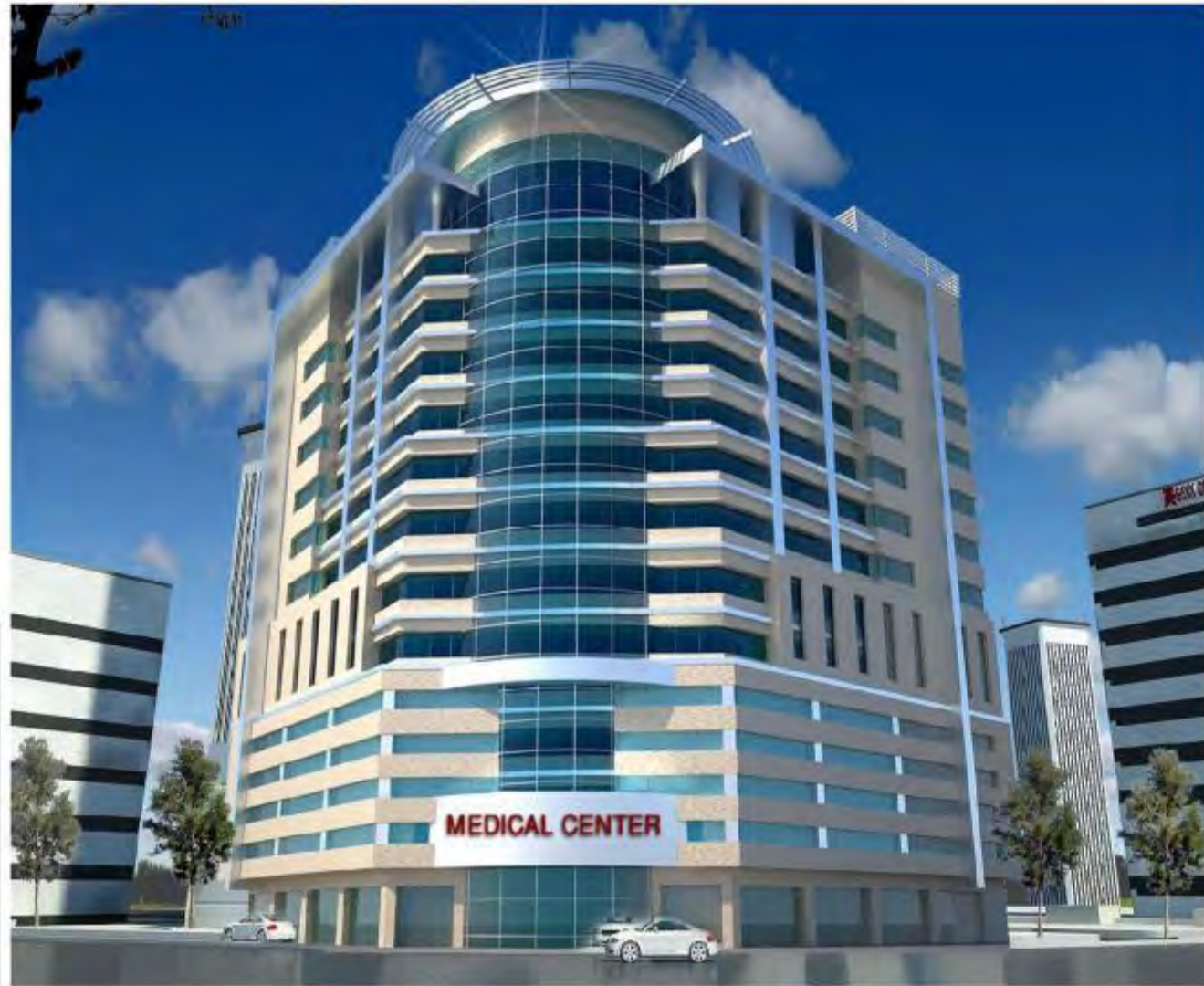
MEDICAL CENTER SHARJAH ( G + 13 )