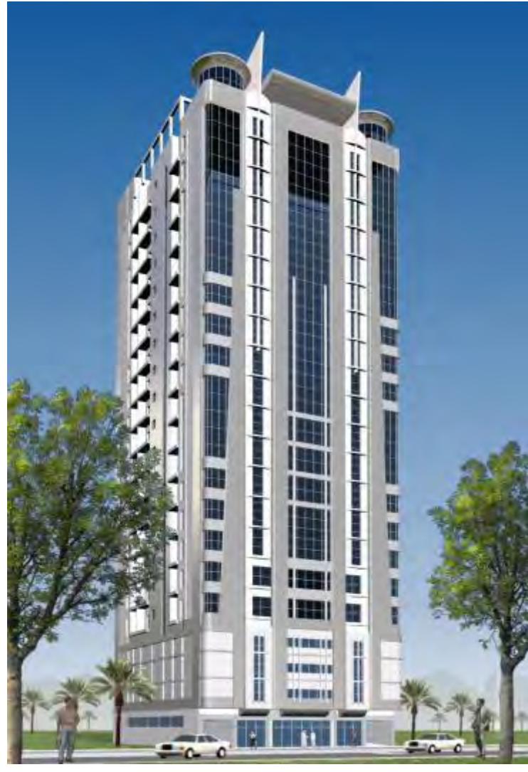
Al Naily Tower, Sharjah ( 2B + G + 3P + 20 )