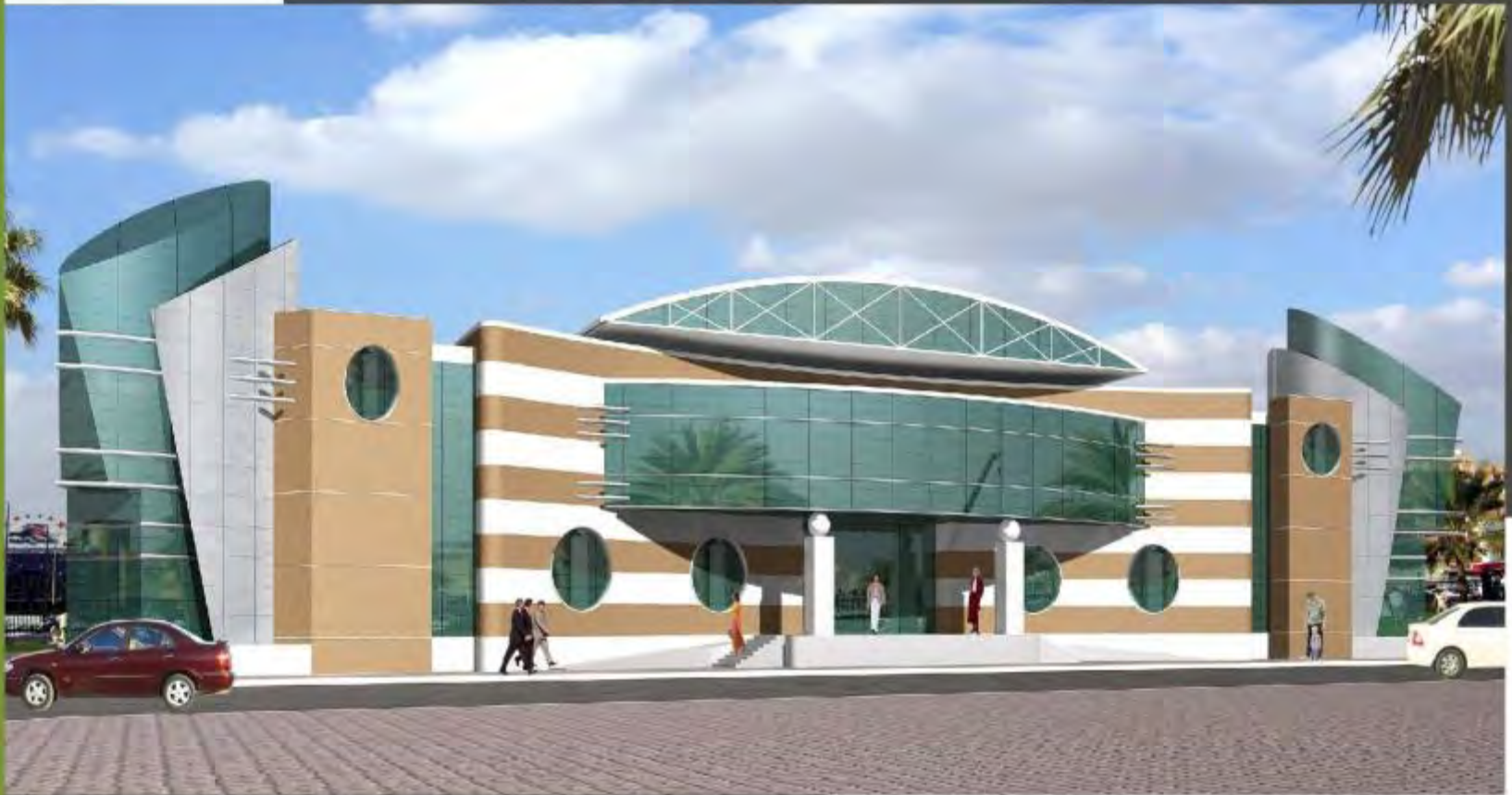
Shopping Center, Sharjah