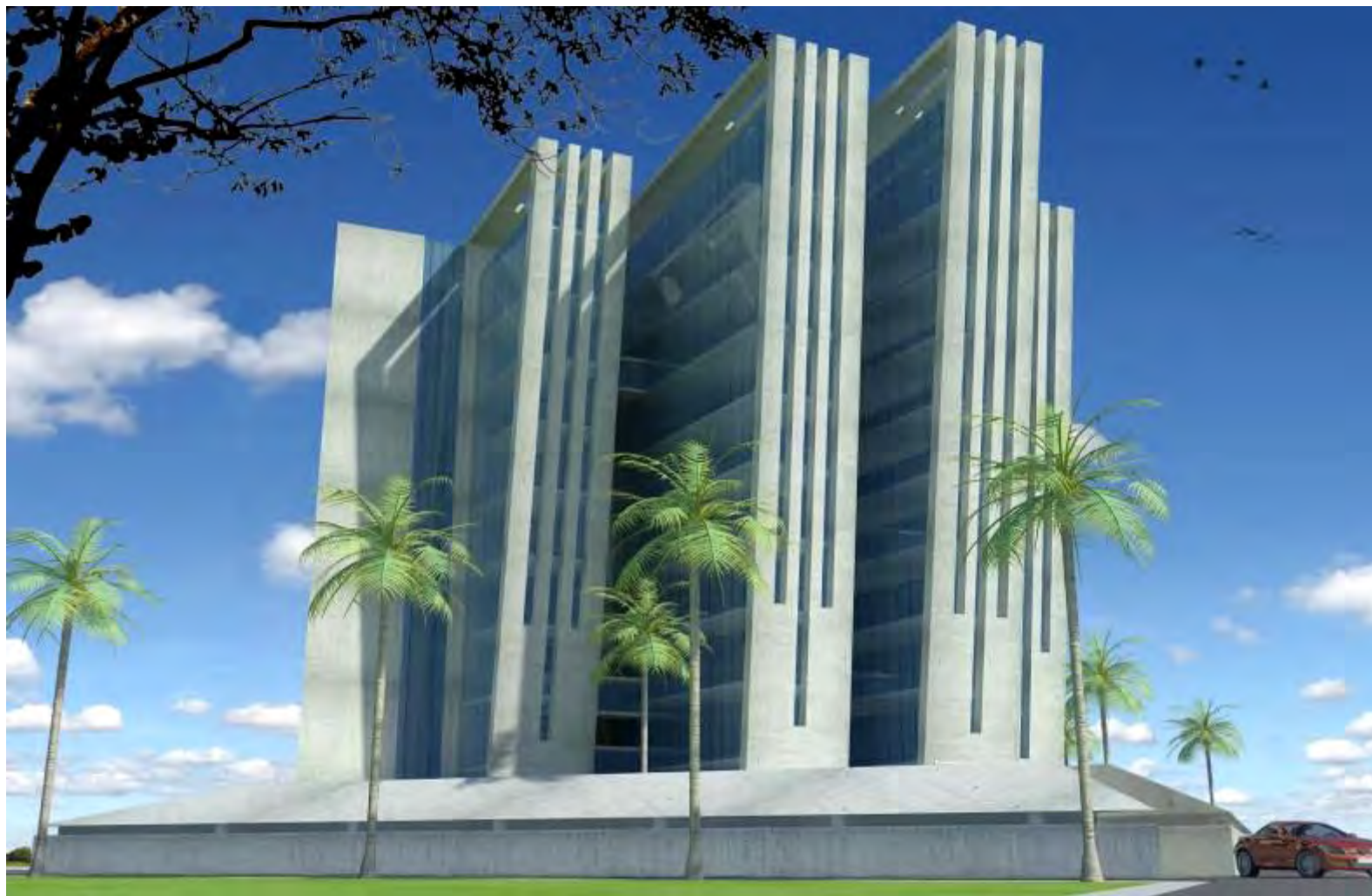
Residential Complex, Dubai (2B + G + M + 12 )