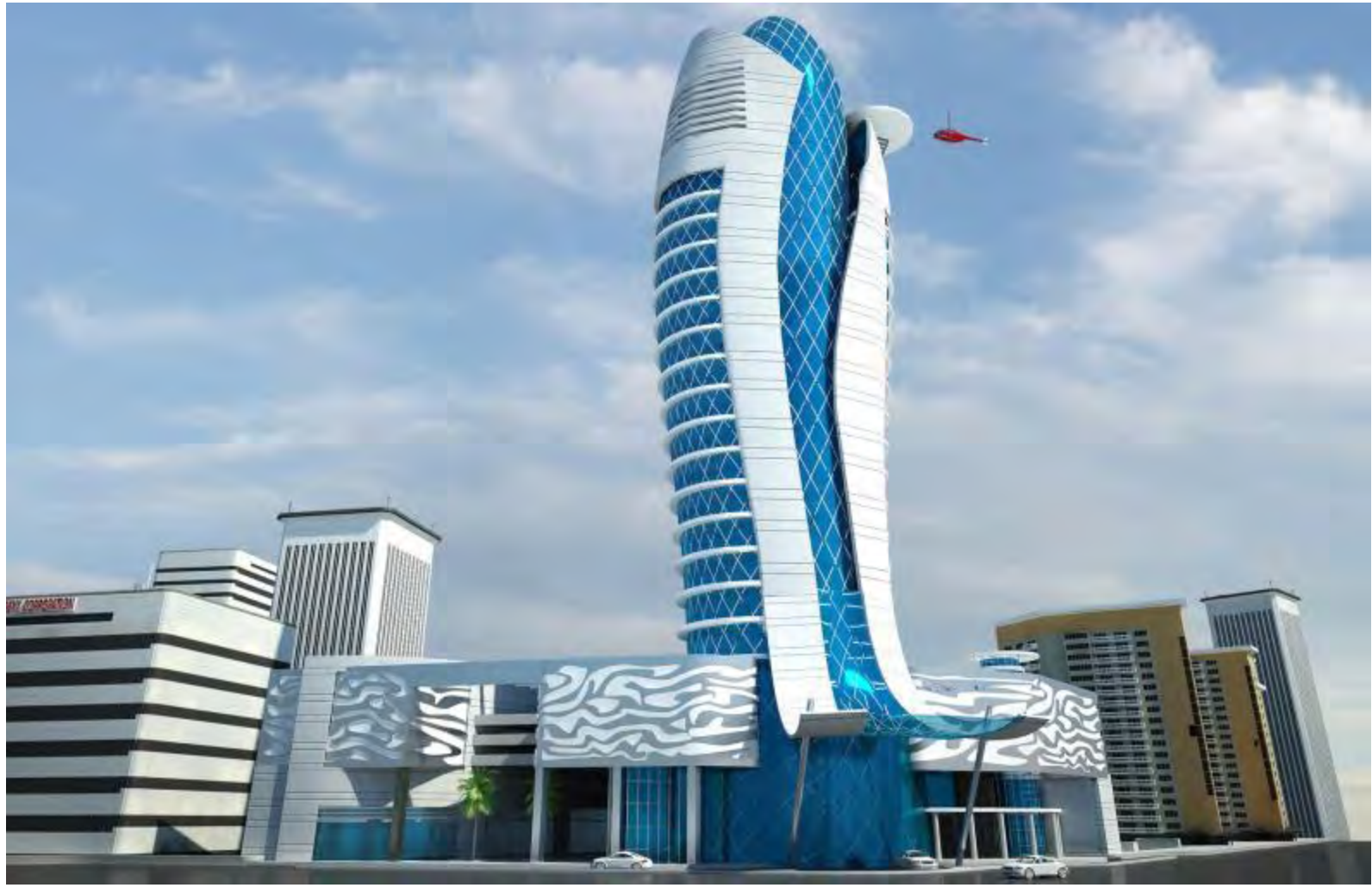
Residential Tower, Abu Dhabi ( G + 4P + 22 )