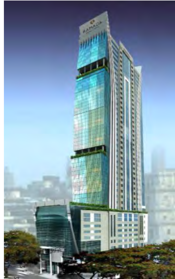
Ramada 5 Stars Hotel, Sharjah ( 2B + G + 34 )