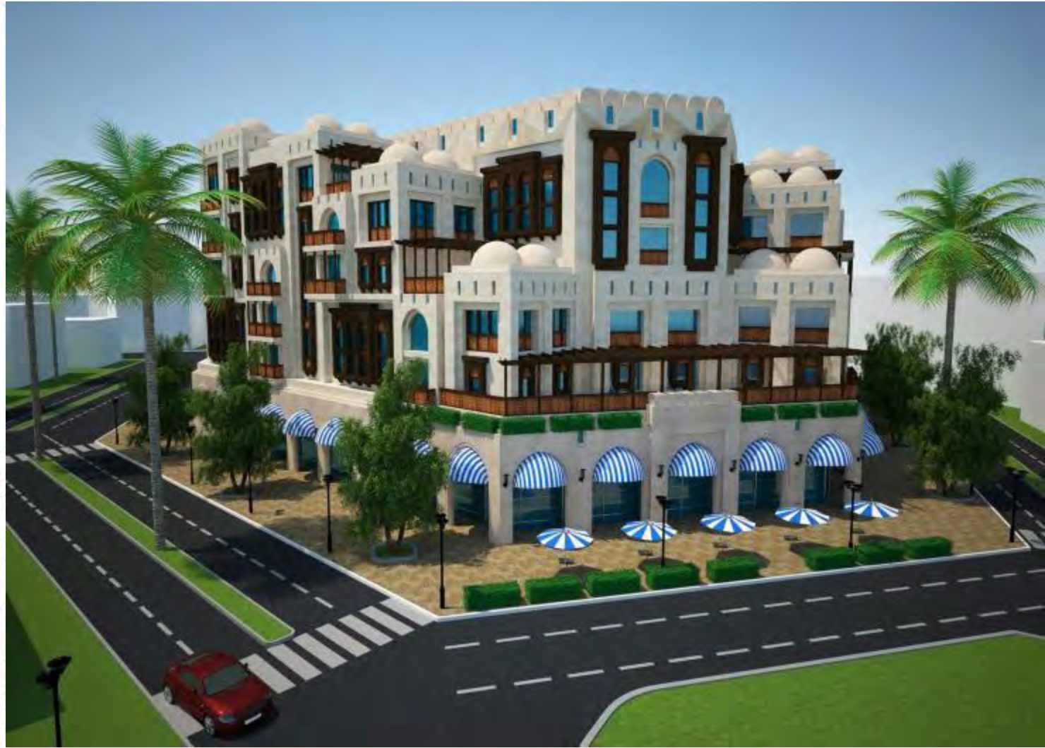
Oman 5 Stars Hotel, Muscat ( G + 4 )