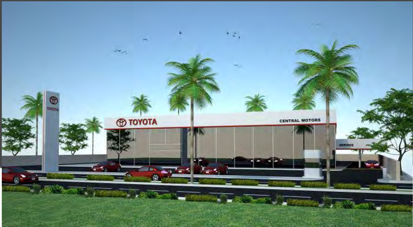
Proposed Toyota showroom at Iraq Owner: General Motors