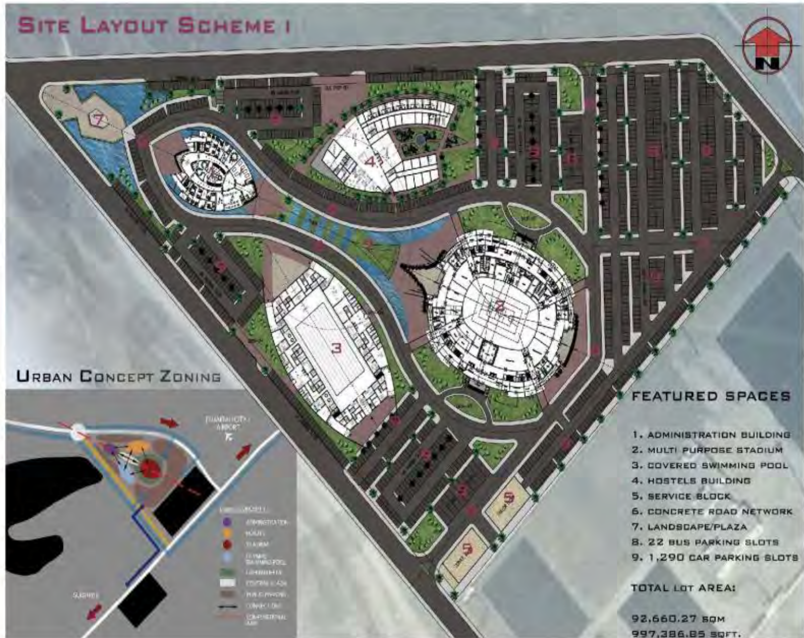
Fujairah sport complex