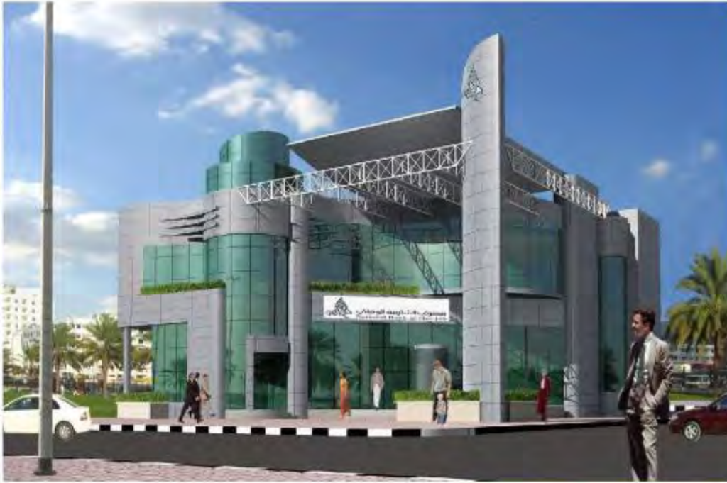
National Bank of Sharjah