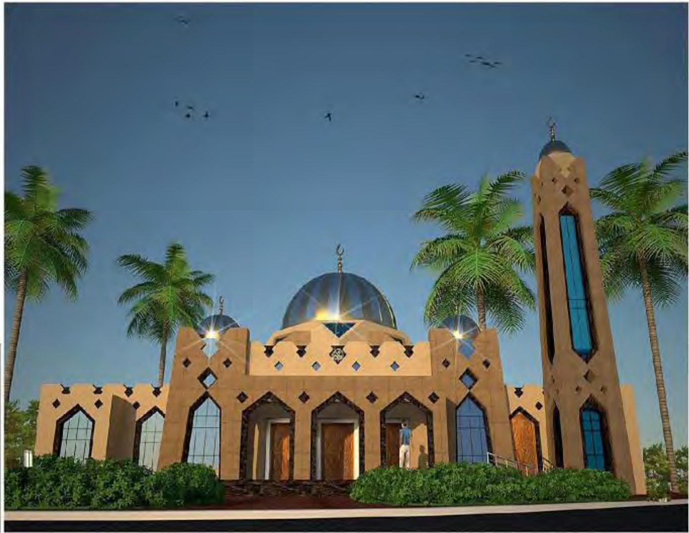
MOSQUE 400 PERSONS, UMM AL QUWAIN