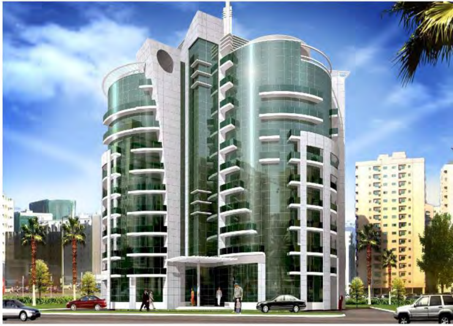
Portsayed 4 Stars Hotel, Dubai ( B + G + 10 )